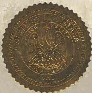
John Bel Edwards Governor

IN WITNESS WHEREOF, I have hereunto set my hand officially and caused to be affixed the Great Seal of the State of Louisiana, at the Capitol, in the City of Baton Rouge, on this 1st day of April A. D., 2022.